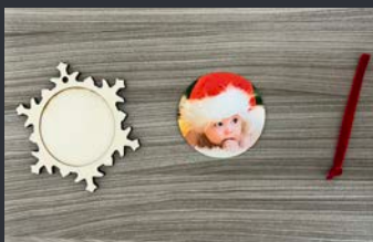
1. Cut photo to size (Hand Cutters available)