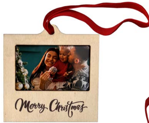
B Wooden Engraved Ornament - Insertable