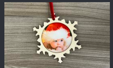
4. Add ribbon or string – display or gift!