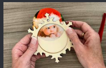
3. Slide photo into the ornament