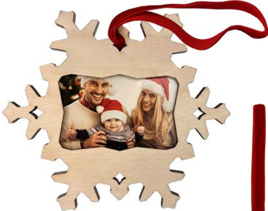
A Wooden Classic Snowflake - Insertable